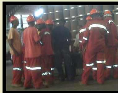
Lake Asphalt HSE Week