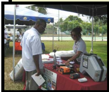
Carib Brewery HSE Week

Kaizen also participated with their Corporate partners in supporting their HSE initiatives.