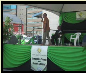
TSTT Safety Month