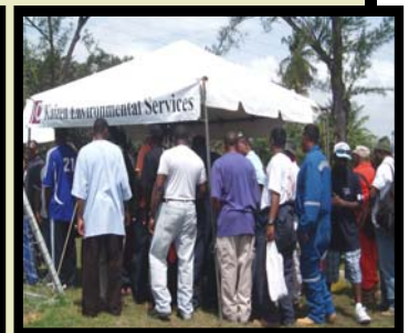
Carillion 1000,000 Man Hrs